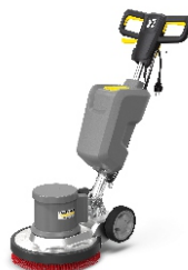
BDS 43/150 C Classic *IN