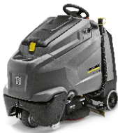
B 95 RS D 65 R