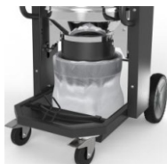
Longopac Disposal System