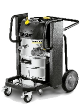
IVC 60/24 - 2 Ap