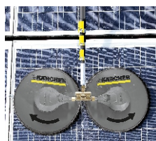
iSolar 800 Solar Panel Cleaning