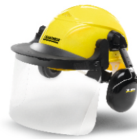
Safety helmet with hearing protection & visor