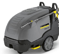
HDS 10/20-4M Eco