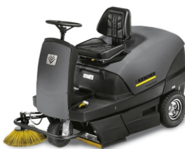
KM 100/100 R P