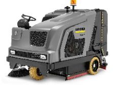
B 300 RI