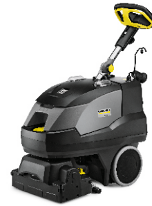
BRC 40/22 C