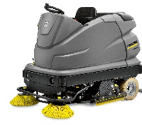
B 250 R Bp