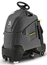
BD 50/40 RS Bp