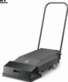
BR 45/10 Esc