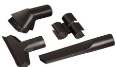
Vacuum Tool Kit