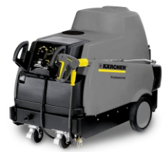
HDS 2000 Super