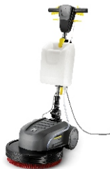
BDS 43/180 C *IN