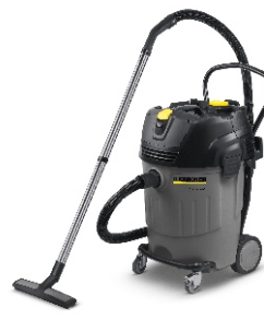
NT 65/2 Ap