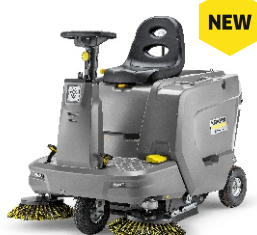
KM 85/50 R Bp