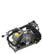
HD 5/11 Cage