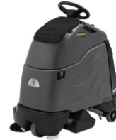
CV 60/2 RS