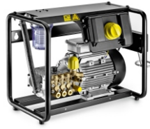
HD 7/16 - 4 Cage Classic