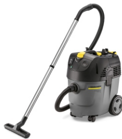
NT 35/1 Ap