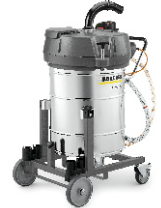
IVR-L 100/24-2 Tc Me