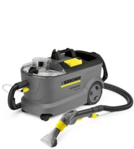
Puzzi 10/1 *Eu