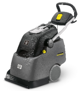
BRC 45/45 C Ep