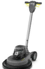
BDP 50/1500 C