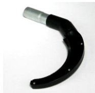
Pipe Cleaning Nozzle