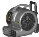
AB 45 Classic