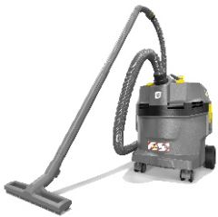
NT 22/1 Ap L