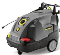
HDS 8/18-4 C