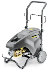
HD 9/20-4 Classic