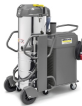
IVS 100/75 M