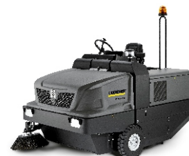
KM 150/500 Classic