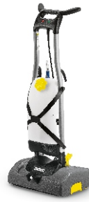
BRS 43/500 C