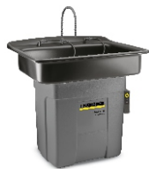
PC 100 M2 BIO