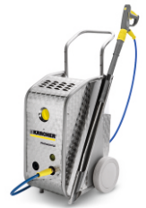
HD 10/15-4 Cage Food