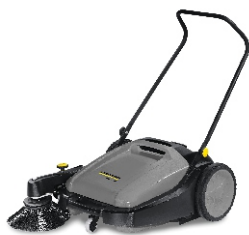
KM 70/15 C