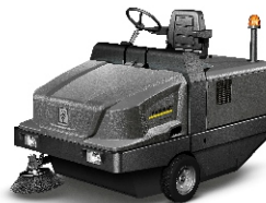
KM 130/300 Classic