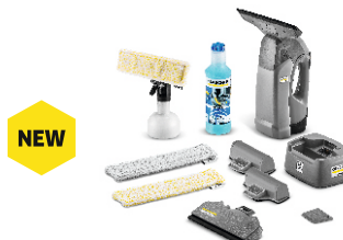
WVP 10 Adv