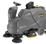
B 150 R Bp