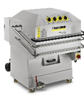
PC 60/130 T