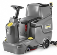
BD 50/70 Bp Classic