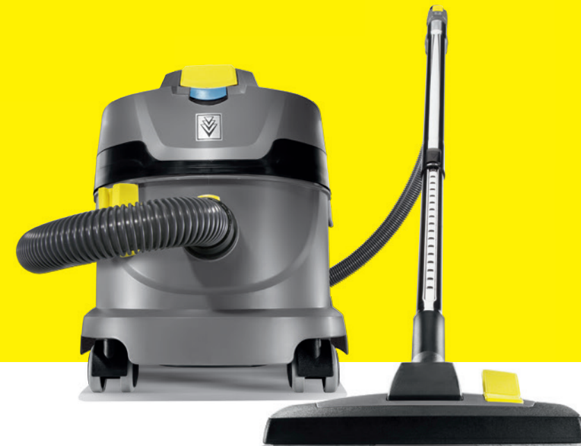
T 9/1 Bp