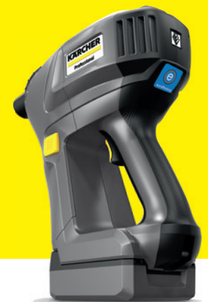
HV 1/1 Bp