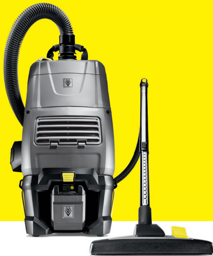
BV 5/1 Bp

You have everything you need with our battery-operated dry vacuum cleaners. Top performance and cleaning quality. All these machines easily compete with comparable mains-operated dry vacuum cleaners. No power cable – it only gets in the way. No more plugging in/unplugging. Our new battery-operated dry vacuum cleaner T 9/1 Bp runs for 24 minutes on one charge and for 46 minutes in eco!efficiency mode. Our backpack vacuum BV 5/1 Bp is unbeatable where space is tight: cinemas, buses, trains and aeroplanes. And our handheld vacuum cleaner HV 1/1 Bp is the powerful and durable all-rounder for tradesmen and service providers.