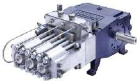
High Pressure Plunger Pump

Max. operating pressure of 4000 bar and max. flow rate of 5.3 l/min