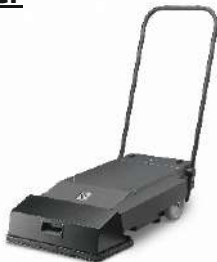
BR 45/10 Esc