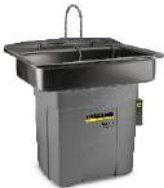
PC 100 M2 BIO