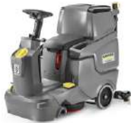
BD 50/70 Bp Classic