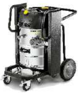
IVC 60/24 - 2 Ap