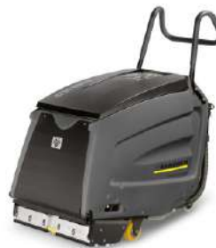
BR 47/35 Esc