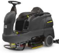
B 90 R Bp