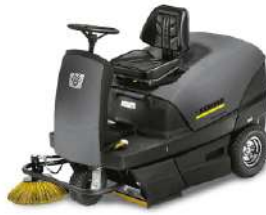
KM 100/100 R P