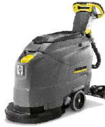
BD 43/40 Classic EP