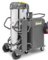
IVS 100/75 M