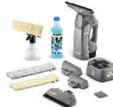
WVP 10 Adv