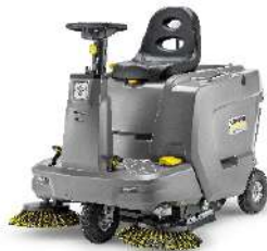
KM 85/50 R Bp