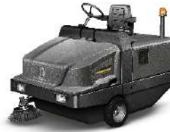
KM 120/250 R D Classic