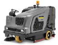
B 300 RI