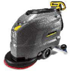
BD 50/50 Classic