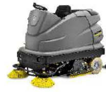
B 250 R Bp