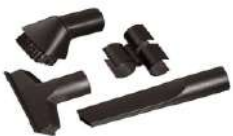
Vacuum Tool Kit