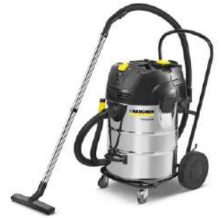
NT 75/2 Ap Me TC