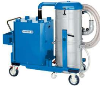
High-performance Industrial Vacuums