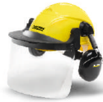
Safety helmet with hearing protection & visor