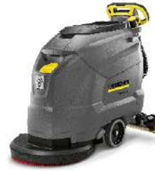
BD 50/60 Classic EP