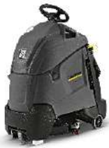
BD 50/40 RS Bp