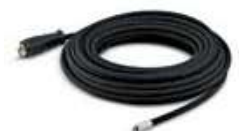
Drain Cleaning Hose