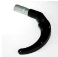
Pipe Cleaning Nozzle