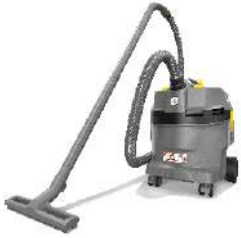
NT 22/1 Ap L