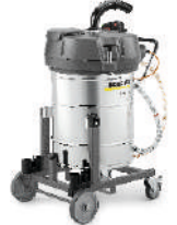
IVR-L 100/24-2 Tc Me