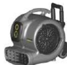
AB 45 Classic