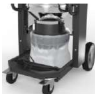
Longopac Disposal System