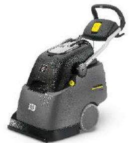
BRC 45/45 C Ep