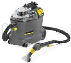
Puzzi 8/1 C