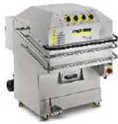
PC 60/130 T