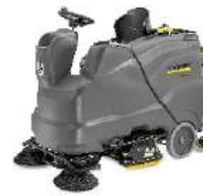
B 150 R Bp