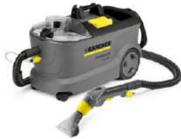
Puzzi 10/1 *Eu