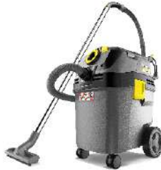
NT 40/1 Ap L