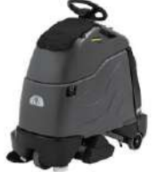
CV 60/2 RS