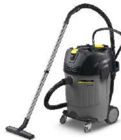
NT 65/2 Ap