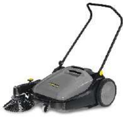
KM 70/15 C