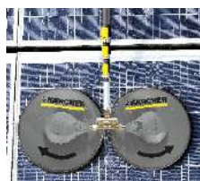
iSolar 800 Solar Panel Cleaning