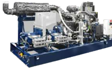
High Pressure Water Jetting Systems

Max. operating pressure of 4000 bar and max. flow rate of 5.3 l/min