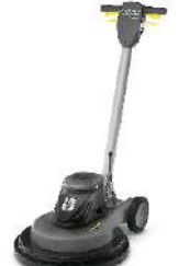
BDP 50/1500 C