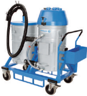
Liquid And Swarf Vacuums