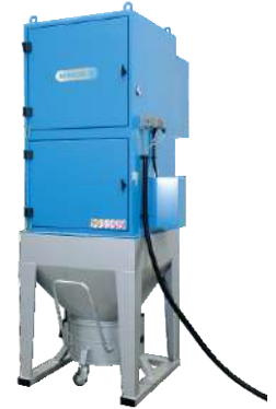
Dust Removal Systems