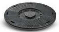
Universal Pad Holder