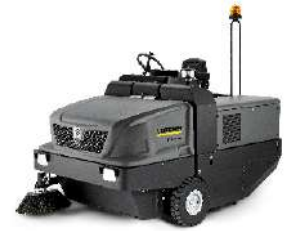
KM 150/500 Classic