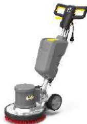
BDS 43/150 C Classic *IN